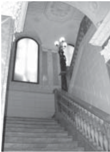
The Rome Studies Center's recently renovated stairwell.

R ENOVATIONS TO THE SCHOOL'S ROME STUDIES center are now complete after a fire damaged a section of the Center early last summer. Repaired and restored were the graduate seminar room and the stair hall.