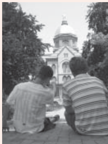
Taking part in the School's Career Discovery Program, high school students sketch the Golden Dome.

Career Discovery is geared toward high school students who want to learn about studying