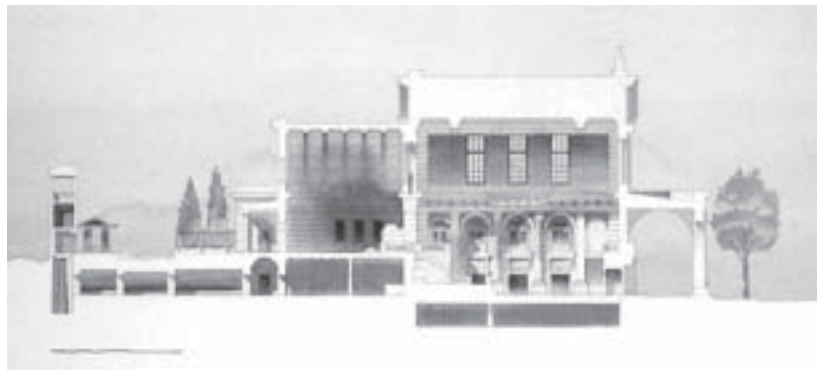
Andrew Wilson's rendering of a proposed South Bend Amtrak station shows the connection between the street level and the track level.

ASSOCIATE PROFESSOR PALOMA PAJARES' FOURTH-year studio designed new train station in downtown South Bend at the intersection of Main Street and the Amtrak railroad. The students were encouraged to design station renderings that do not cover the rail tracks, but rather sit to one side of them, acting as a connector between